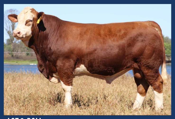
LOT 8 POLL