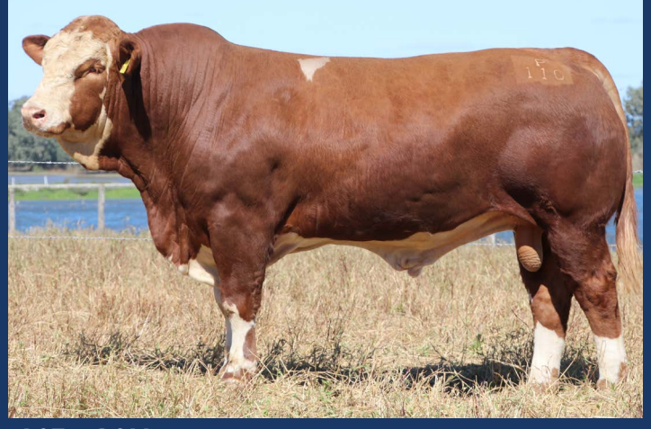
LOT 1 POLL