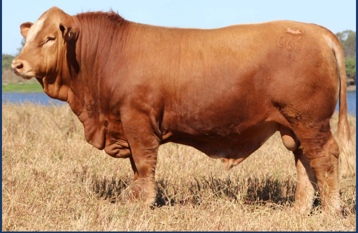
LOT 89 POLL