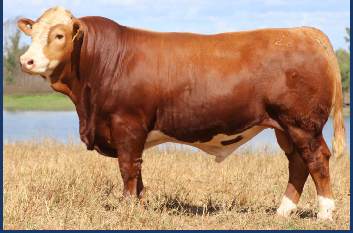
LOT 28 SCURR