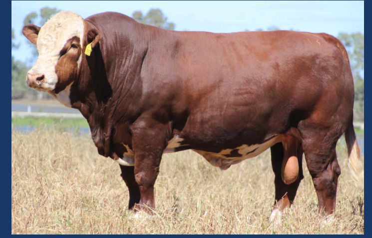
LOT 73 POLL