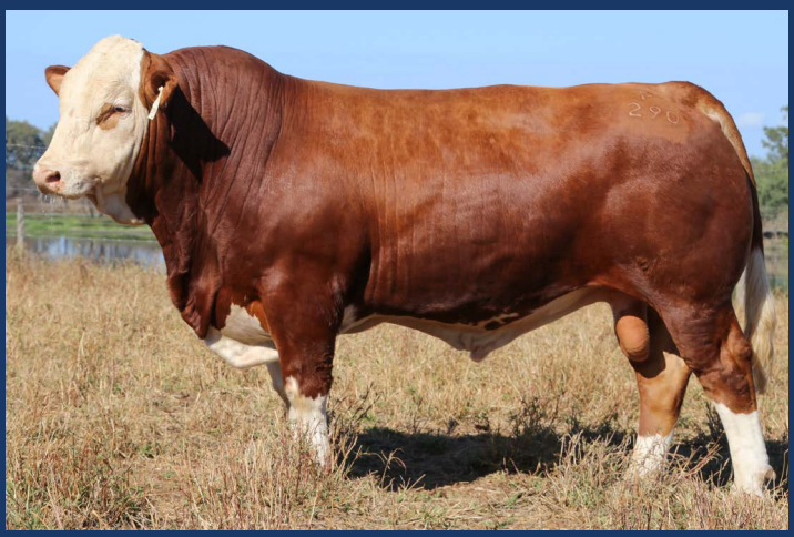
LOT 6 POLL