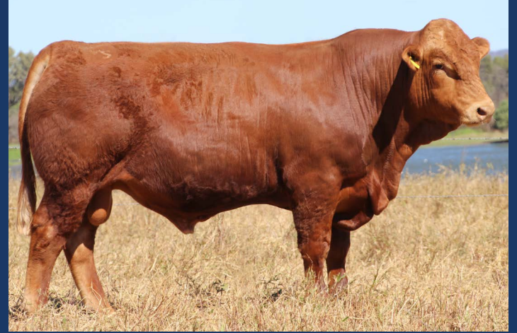
LOT 14 POLL