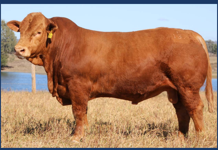
LOT 15 POLL