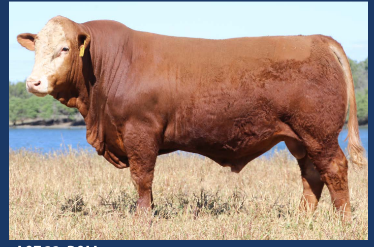
LOT 23 POLL