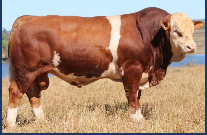
LOT 71 POLL