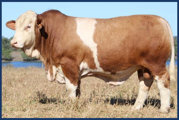
LOT 49 POLL