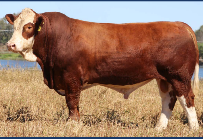
LOT 3 POLL