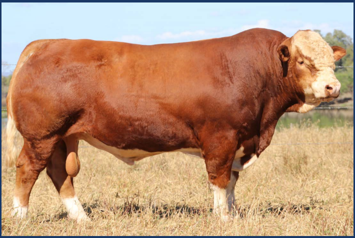
LOT 72 SCURR