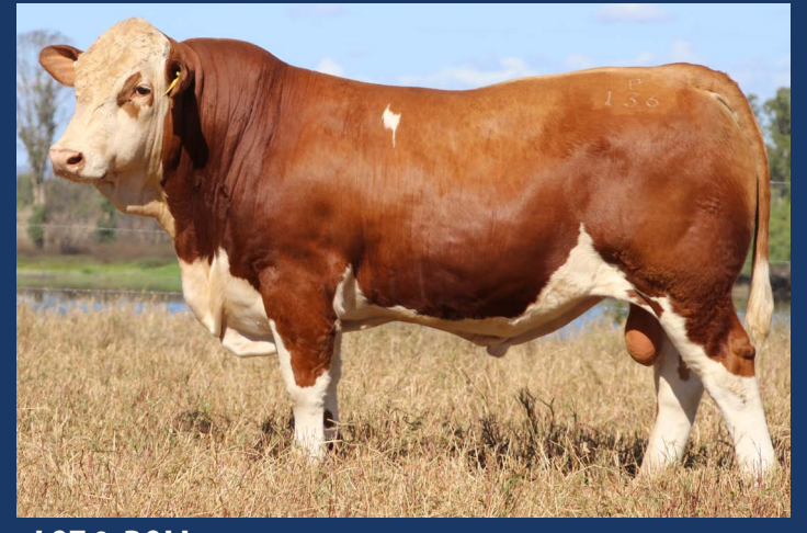
LOT 9 POLL