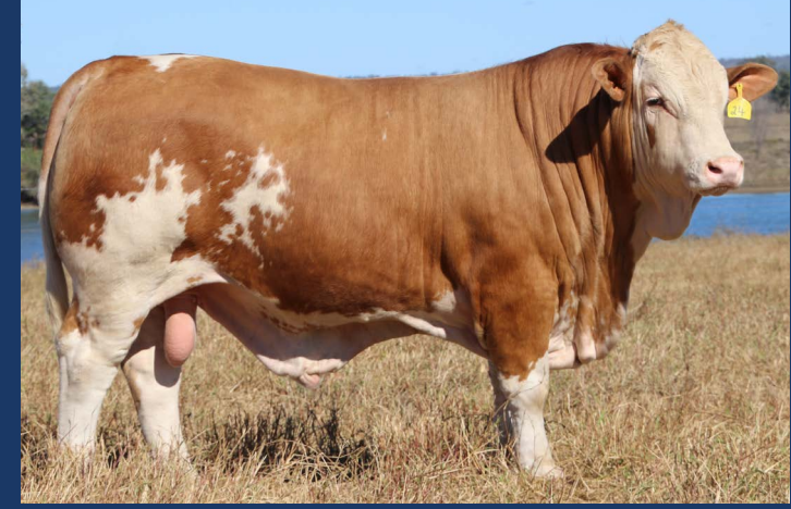
LOT 51 POLL