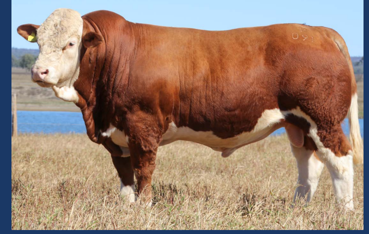
LOT 75 POLL