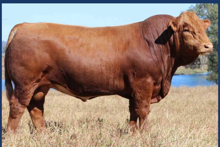
LOT 17 POLL