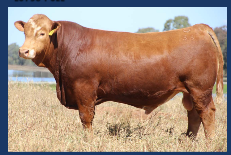
LOT 45 POLL