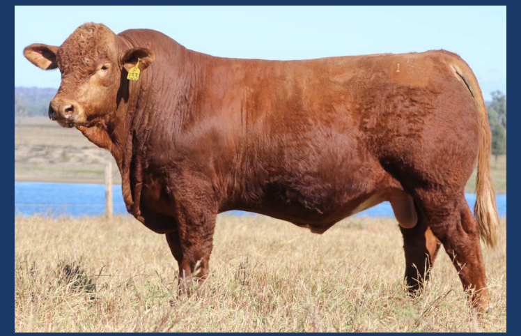
LOT 16 POLL