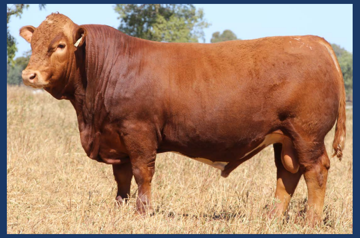
LOT 46 POLL